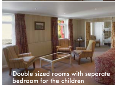
Double sized rooms with separate bedroom for the children