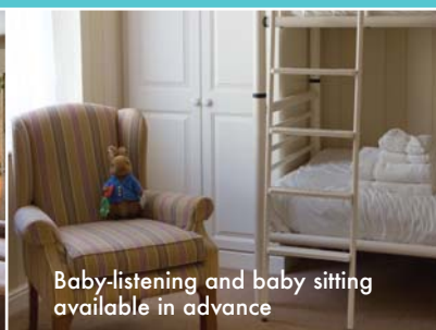
Baby-listening and baby sitting available in advance