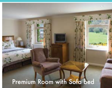
Premium Room with Sofa bed

Children under 15 years of age are welcome at any time and our pool offers a beach-style family area for our very youngest guests.