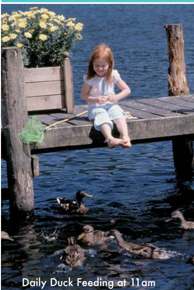
Daily Duck Feeding at 11 am

Families are an important part of our hotel and we offer a family menu in our Fine Dining Restaurant, as well as the "Children's Choices" shown here.