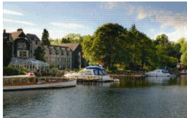
➤ TRAVELLERS RETREAT The Lakeside Hotel on the southern tip of Lake Windermere boasts four AA stars

We, on the other hand, had left home barely an hour earlier and, after a trouble free journey up the M6, had checked in at the Lakeside Hotel for the weekend. We really should not take this for granted.