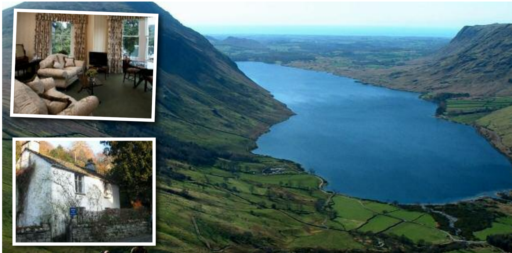
▶▶ LAKESIDE LUXURY The stunning views over Wastwater. Inset top, the executive suite at the Lakeside Hotel and inset bottom, Dove Cottage where history comes alive and you can see where Wordsworth wrote much of his poetry

two adults and three children in a variety of configurations.