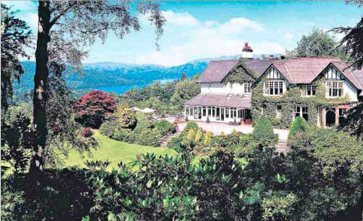
Literary links: Linthwaite House would not be out of place in an Agatha Christie novel, and is close to sites associated with Wordsworth and Beatrix Potter