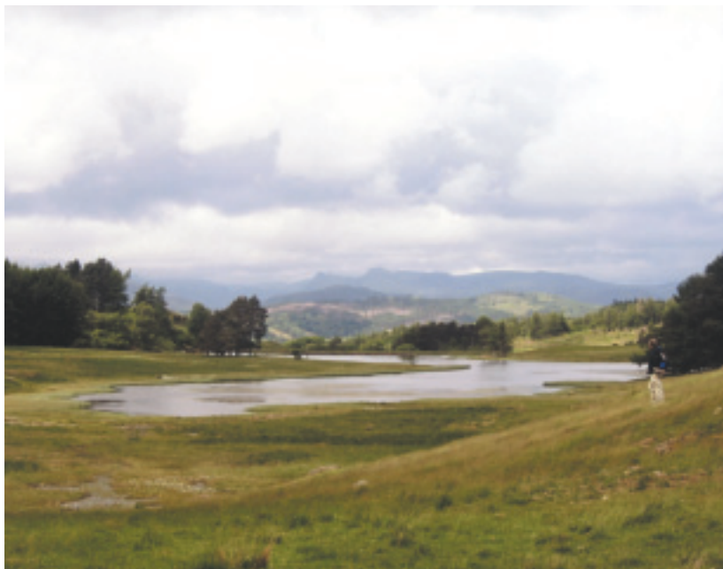
Wise Een Tarn - Photo: M. A. Fleming